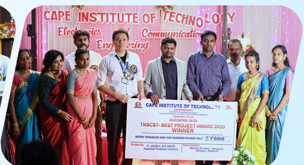
Department Activities- 2k23